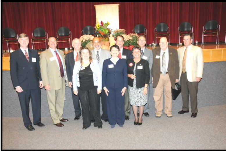
CANDIDATES FOR BOARD OF SUPERVISORS AND TREASURER POSITIONS